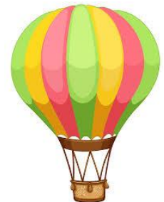
hot air balloon